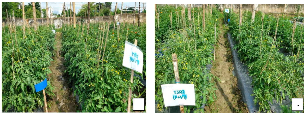
Figure 2. Variety EW 815 at 58 DAT a) In Soil Treatments (Left) b) In Farmers practice (Right)