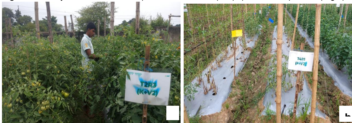
Figure 3. Variety EW 834 at 58 DAT a) In Soil Treatments (Left) b) In Farmer practices (Right).

The data presented in Table 3 shows the yield of tomato production in 500 m 2 under different bacterial wilt control methods. Two categories of bacterial wilt control are compared: "Soil Treatments" and "Farmer Practices".